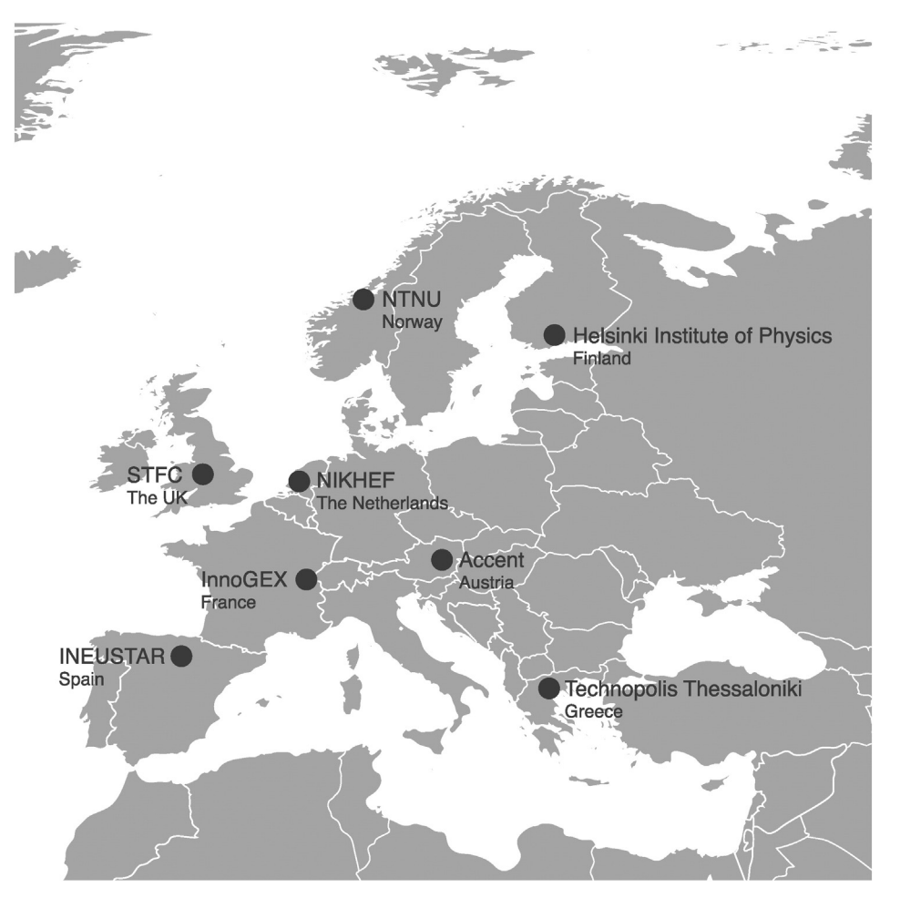
Fig. 3. Map showing the current location of BICs of CERN technologies and the partner organisations.

The total budget for all FP7 projects CERN took part in was 692 million euros, 404 million came from the European Commission and 288 million was matched by the partners. From all of these projects, CERN received in total 111 million euros and provided matching funds of 93 million euros. Perhaps more interesting than the funding itself is the number of partners CERN collaborated with, in total 526. Of these many were universities and other research organisations, but also 73 small and medium size companies and 53 larger companies, indicating that EU projects serve as a useful contact surface between CERN and the private sector.