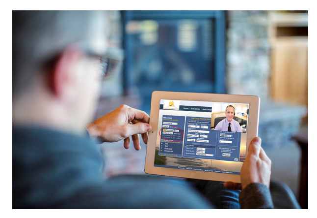
Figure 2. Consumer talking to a remote expert

the potential to elevate conversion to a whole new level due to the richness of immersion it provides the end user. Features such as co-browsing, screen sharing, and content sharing offer a level of interactivity that was not previously available. Recent research indicates that groups utilizing co-browsing technology have higher performance on metrics such as agent utilization rate and average revenue per call than groups that do not (Minkara, 2013).