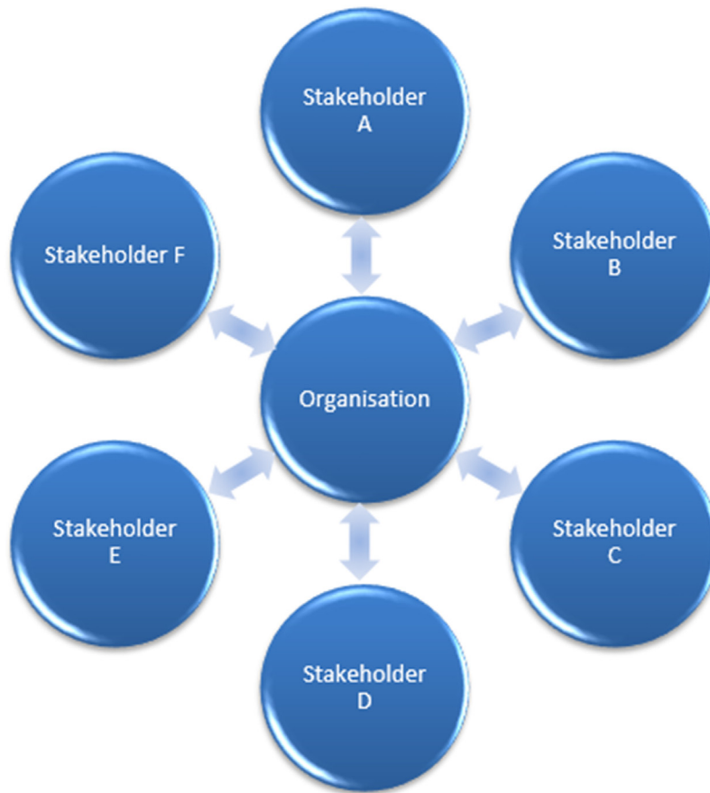
Fig. 1. A traditional organization centric stakeholder map.

One future would be that it becomes totally redundant, with no gate-keeping role and no reason for recognition of its professional expertise because it is within the power of everyone to become a proficient and present communicator. An alternative that we propose is to become the holder of the ring in the circuit: an expert who communicates about communication. Internally this means becoming a coach and mentor about best practice and establishing common meaning based on agreed purpose, values and a shared culture. In essence this entails setting the conditions for effective communication so that viable matches are made between peers, but not undertaking the actual communication itself. In doing so, the function helps a circuit of communication which allows the organization to put a boundary around itself defined by the types of conversations its own members have internally which will have their own unique character: one circuit of communication.