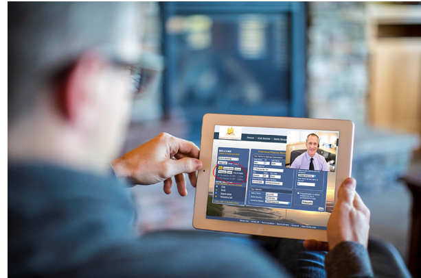
Figure 2. Consumer talking to a remote expert

the potential to elevate conversion to a whole new level due to the richness of immersion it provides the end user. Features such as co-browsing, screen sharing, and content sharing offer a level of interactivity that was not previously available. Recent research indicates that groups utilizing co-browsing technology have higher performance on metrics such as agent utilization rate and average revenue per call than groups that do not (Minkara, 2013).